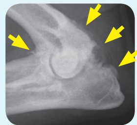
Arthritic elbow joint in a dog with lots of "fluffy" new bone (yellow arrows) around the joint, indicative of marked arthritis.