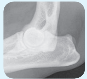
X-ray of a normal elbow joint

Radiography is commonly used to investigate joint problems.